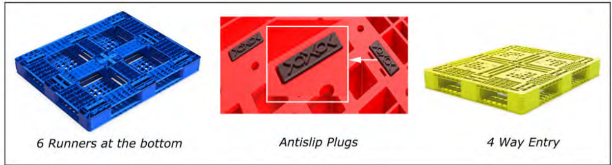
6 Runners at the bottom