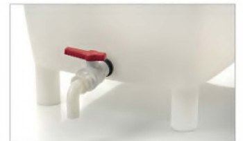
Drainage valve (Optional)