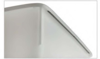
Side reinforcement for better strength