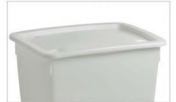
Top lid available (Optional)