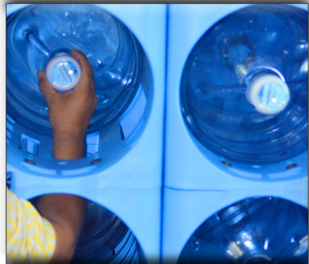
Reach through feature